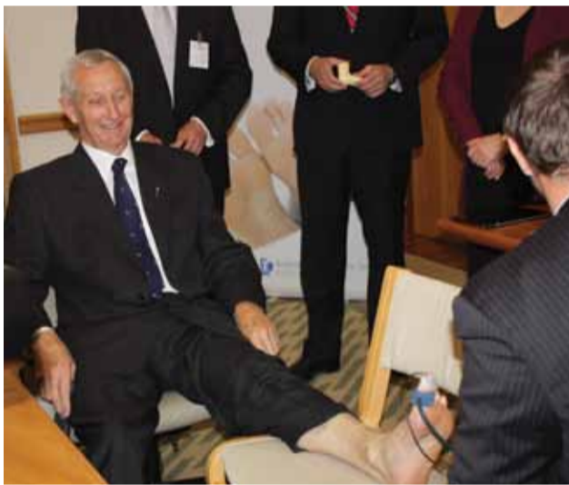
Bruce's foot gets a clean bill of health in Parliament House